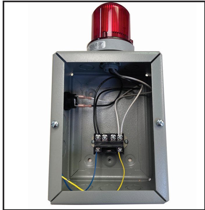
External Alarm and Strobe Light - This option provides audible and visual indication that carbon monoxide has exceeded 50 ppm.