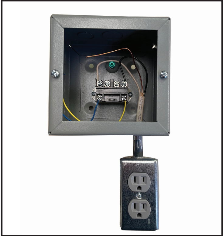
Exhaust Duplex Outlet - This option disrupts the 120 Volt power to the duplex outlet causing the boilers to cease operation.